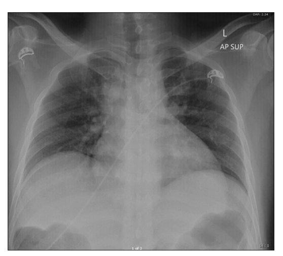
Figure 1: X-ray image on admission. Diagnosis: Normal cardiac configuration, both lung felids show increased bronchovascular markings; however, no detected pulmonary opacities and clear costophrenic angles

A nasopharynx reverse transcriptase–polymerase chain reaction test for COVID-19 was performed on admission and the result came positive with variant (BA.4/BA.5). Other significant laboratory results include refractory hypokalemia (potassium level were 2.0, 1.9, and 1.8 mmol/L), normal magnesium (2.94 mg/dL), hyperglycemia (point of care test was 421mg/dL and glycosylated hemoglobin (HbA1c) was 10.4%) and interleukin-6 was (175.00 pg/mL). Human immunodeficiency virus was ruled out by the enzyme-linked immunosorbent assay test. Chest X-ray showed clear costophrenic angles [Figure 1], but brain computerized tomography scan with contrast