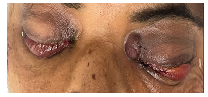
Figure 3: Ophthalmoplegia of both eyes, bilateral proptosis, and bilateral blindness

DM was often detected as an underlying disease; poor glycemic control might be a definite predictor of COVID-19 associated ROCM complication. A recent review reported that up to 87% of patients who developed ROCM were presented with uncontrolled DM.<sup>[2]</sup> As our patient presented to ER with an uncontrolled DM (HbA1c of 10.4%). One explanation for this association could be hyperglycemia stimulated inflammatory state which could be potentiated by concurrent COVID-19 infection.<sup>[10]</sup> In COVID-19 patients, several divergent