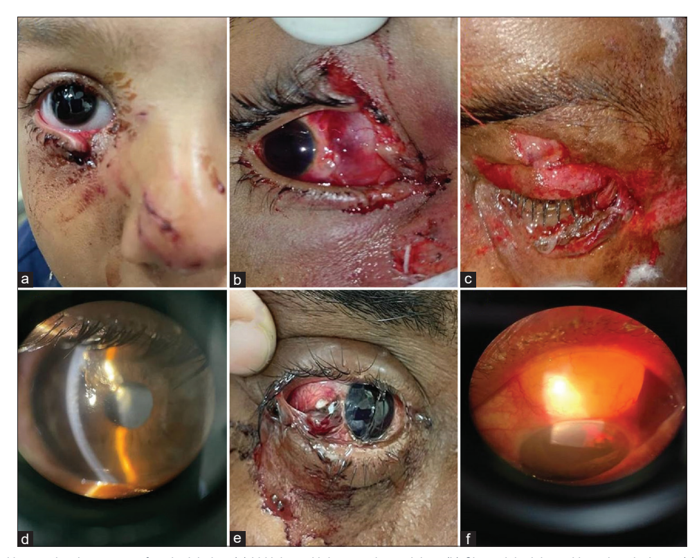
Figure 2: The Clinical image showing pattern of ocular injuries. (a) Lid injury with lacerated nose injury, (b) Close globe injury with conjunctival tear, (c) multiple lid laceration with lower lid avulsion, (d) open globe injury with corneal tear and a metallic foreign body over iris, (e) open globe injury - scleral tear with choroid and vitreous prolapse, (f) open globe injury with Phacocele and Anterior Chamber Hyphema

ocular injuries, with the younger population having higher odds of injury than old age.<sup>[2-5]</sup> In contrast, Belmonte-Grau et al.,<sup>[8]</sup> in their study on the Spanish population, reported a mean age of 54 years among the victims of OT. Another study by Choovuthayakorn et al.<sup>[12]</sup> on the Asian population revealed age differences between genders in ocular injuries and observed a mean age of 39.8 (22.9) years for females and 43.8 (17.8) years for males. Notably, studies by Belmonte-Grau et al. and Choovuthayakorn et al. had domestic accidents and workplace injuries, respectively, as the major cause of OT in contrast to RTAs in the present study, which may partially explain the mean age difference between these studies.<sup>[8,12]</sup> The higher incidence of ocular injuries among the young and productive age group has long-lasting effects on their productivity and imposes a significant economic burden on both the affected individuals' families and society at large.